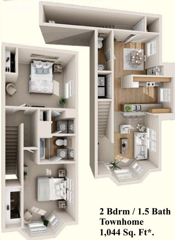
2 Bdrm / 1.5 Bath Townhome 1,044 Sq. Ft.*