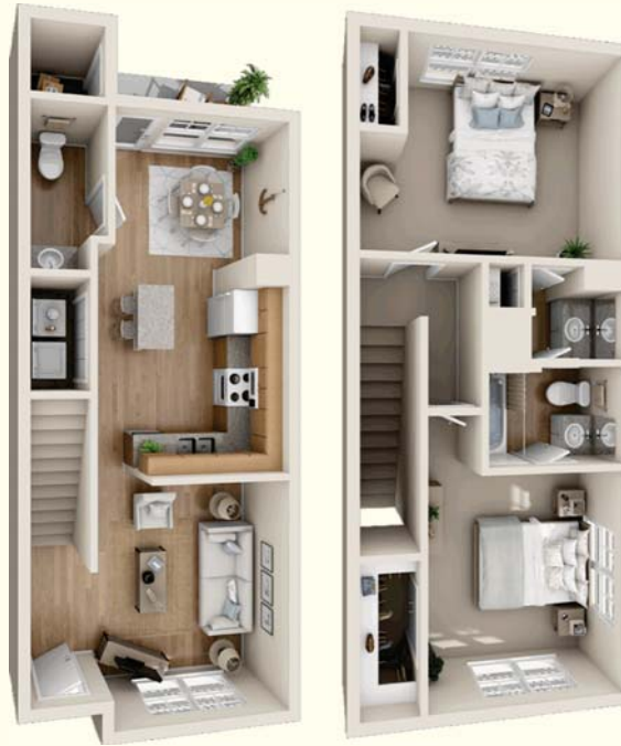
2 Bdrm / 1.5 Bath Townhome 974 Sq. Ft.*