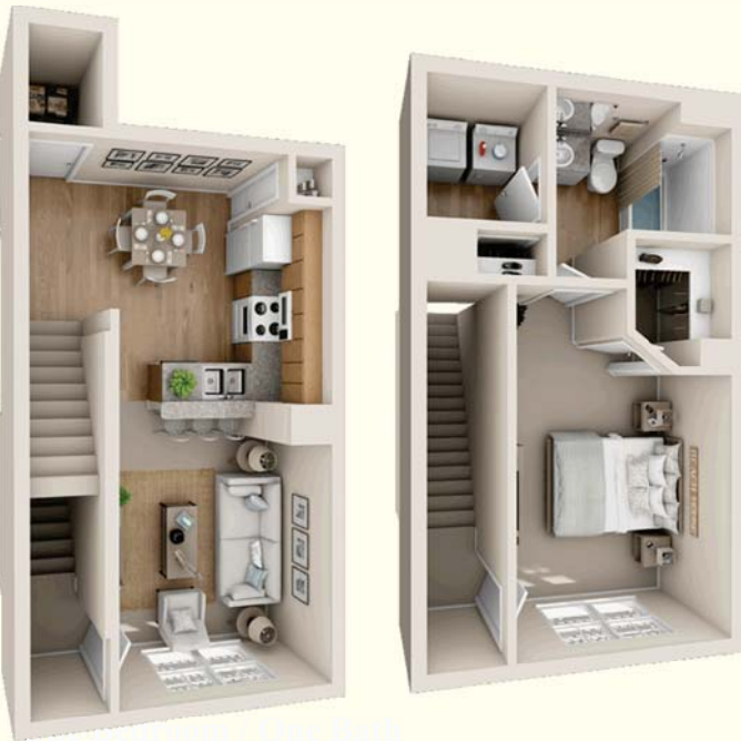
1 Bdrm / 1 Bath 760 Sq. Ft.*